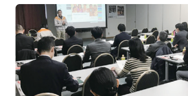
Opinion exchange meeting regarding corporate activities abroad

We continue to study and deepen our understanding of overseas environmental regulations and trends, and we disseminate highly effective information on their impact as well as preventive measures both within and outside EPOC. Our goal is to contribute to the overseas activities and business development of our members through the planning of international events (seminars, study sessions, opinion exchange meetings, and so on) in cooperation with each subcommittee/team and their planning activities.