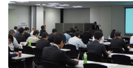
Seminar on leading environmental management

We provide member companies with information useful in their work with environmental management and administration, such as societal movements and laws and regulations related to environmental issues, technological information, and case examples from other companies through seminars and inspections. Study group meetings are also held by subcommittee members at their own places of study.