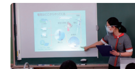
Environmental talk given by corporate member at a school

In order to support environmental awareness and environmental education of youth, particularly elementary and junior high school students, we provide practical, activity-oriented environmental lectures using the educational tools and facilities of our member companies, and we engage in a wide variety of environmental awareness activities in cooperation with the government and other organizations.