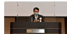
2022 Aichi Environmental Award Ceremony

The Aichi Environment Awards, which is undertaken on commission by the Aichi Prefectural Government, is one of the main channels for raising public awareness about environmental initiatives and encouraging new efforts that build on them. Lectures and events that bring together corporate members are also organized in order to fortify central Japan's roles as a global leader on environmental issues.