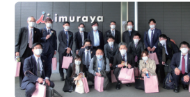
On site tour

By researching current social trends toward achieving carbon-neutrality and innovative initiatives related to hydrogen and energy conservation, and by communicating wide-ranging case studies and information about innovative technology such as energy conservation technology that transcends the boundaries of business categories and industries, we aim to improve each member company and promote mutual exchange and cooperation.