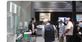
Tour of company that received an Aichi Environmental Award

In order to advance the formation of recycling-oriented societies in the Chubu region, we are holding seminars, inspections, and more together with Aichi Prefecture as we work to increase our know-how and technology as well as exchange information with member companies. We are sharing and disseminating solutions and the latest information with regard to the recycling of resources through a collaboration with industry, government, and academia.