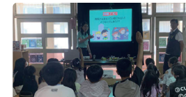
Environmental talk given by corporate member at a school

In order to support environmental awareness and environmental education of youth, particularly elementary and junior high school students, we provide practical, activity-oriented environmental lectures using the educational tools and facilities of our member companies, and we engage in a wide variety of environmental awareness activities in cooperation with the government and other organizations.