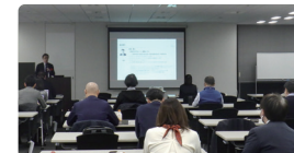
A seminar co-sponsored by the Environmental Management Subcommittee

We are deepening our study of environmental regulations and trends overseas in order to share highly efficacious information about their impact on EPOC and beyond, as well as key points for dealing with them. Our goal is to contribute to our members' overseas activities and business development through collaboration with each subcommittee, team, activities planning division and member to plan seminars, study sessions, discussion forums, exchange meetings with overseas trainees and other such events related to overseas issues.