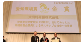
2025 Aichi Environmental Award Ceremony

At the Aichi Environmental Award event hosted by Aichi Prefecture, Aichi Prefecture and the Chunichi Shimbun jointly presented awards for case studies of innovative and effective "technologies and projects" and "activities and education" carried out by companies and organizations. These awards provided an opportunity for environmental activities through communication and information dissemination within the community, including non-member companies.