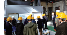
An inspection tour

Through study sessions and inspection tours, we share the latest information on topics related to resource recycling, such as the circular economy and social trends and advancements geared towards the formation of a sound material-cycle society. EPOC and our subcommittee members also practice self and mutual improvement to further strengthen our partnerships.