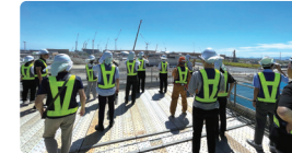
An inspection tour

By researching current social trends toward achieving carbon-neutrality and innovative initiatives related to hydrogen and energy conservation, and by communicating wide-ranging case studies and information about innovative technology such as energy conservation technology that transcends the boundaries of business categories and industries, we aim to improve each member company and promote mutual exchange and cooperation.