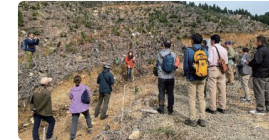
An inspection tour

We support future initiatives from our member companies by holding seminars, research sessions and inspection tours on initiatives such as those aimed at understanding and reducing the impact of all corporate activities on the ecosystem, as well as those related to sustainable use of the benefits to be gained from the ecosystem.