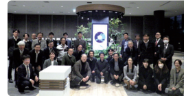
A study session at one of our subcommittee participant companies

We provide member companies with information useful in their work with environmental management and administration, such as societal movements and laws and regulations related to environmental issues, technological information, and case examples from other companies through seminars and inspections. Study group meetings are also held by subcommittee members at their own places of study.