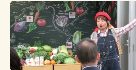
Touring site of biodiversity conservation activities

We support the future initiatives of our corporate members by examining case studies and offering support programs. The initiatives cover all corporate activities with a focus on understanding the impact on the ecosystem, measures for reducing that impact and other corporate initiatives that sustainably use the benefits provided by the ecosystem.