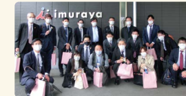
Leading carbon reduction example inspection group

Participants researched current social trends towards a low carbon society and innovative initiatives for hydrogen based society. By sharing cross - industry case studies and advanced technologies, awareness and collaborative partnership among corporate members have been further improved.