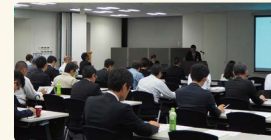
Seminar on leading environmental management

We provide member companies with information useful in their work with environmental management and administration, such as societal movements and laws and regulations related to environmental issues, technological information, and case examples from other companies through seminars and inspections. Study group meetings are also held by subcommittee members at their own places of study.