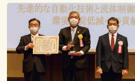
2021 Aichi Environmental Award Ceremony

The Aichi Environment Awards, which is undertaken on commission by the Aichi Prefectural Government, is one of the main channels for raising public awareness about environmental initiatives and encouraging new efforts that build on them. Lectures and events that bring together corporate members are also organized in order to fortify central Japan's roles as a global leader on environmental issues.