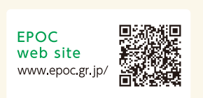
EPOC web site www.epoc.gr.jp/

Reports on EPOC's achievements are compiled and distributed in order to promote the use and application of the information. In addition, the latest information on the environment and EPOC's activities are introduced on our website to raise environmental awareness in various business sectors and expand the scale of our activities.