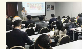
Opinion exchange meeting regarding corporate activities abroad

EPOC heightens its study of overseas environmental regulations and trends and disseminates highly effective information like their effects and countermeasures both internally and externally. Collaborating with each subcommittee and team, we aim to contribute to members' overseas activities and business expansion by planning events (seminars, social gatherings, etc.) related to overseas countries.