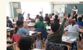
Environmental talk given by corporate member at a school

In order to support environmental awareness and environmental education of youth, particularly elementary and junior high school students, we provide practical, activity-oriented environmental lectures using the educational tools and facilities of our member companies, and we engage in a wide variety of environmental awareness activities in cooperation with the government and other organizations.