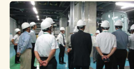
Tour of company that received an Aichi Environmental Award

In order to advance the formation of recycling-oriented societies in the Chubu region, we are holding seminars, inspections, and more together with Aichi Prefecture as we work to increase our know-how and technology as well as exchange information with member companies. We are sharing and disseminating solutions and the latest information with regard to the recycling of resources through a collaboration with industry, government, and academia.